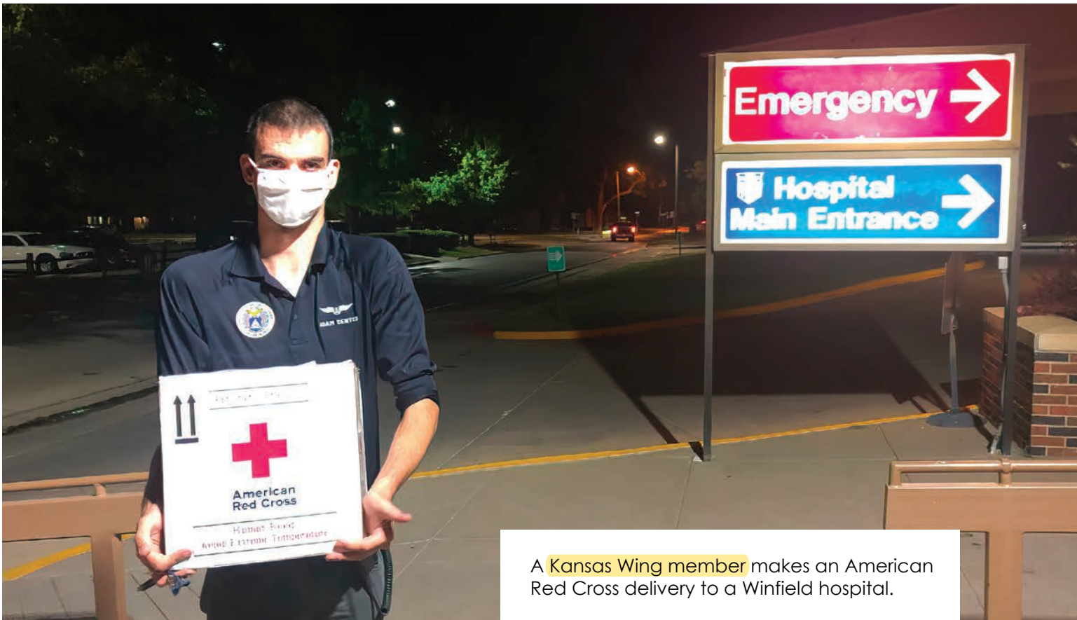
A Kansas Wing member makes an American Red Cross delivery to a Winfield hospital.

Working with the National Guard, the Division of Emergency Management, the Department of Health and Environment and the Red Cross enhanced the wing's relationship with those agencies. The statewide pandemic response has truly been a team effort.